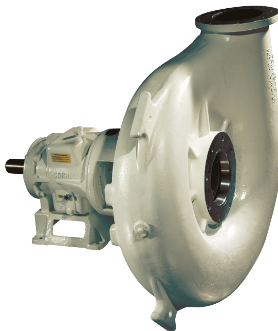
A typical picture of the pump is shown. Please contact Cornell Pump Company for further details. All information is approximate and for general guidance only.