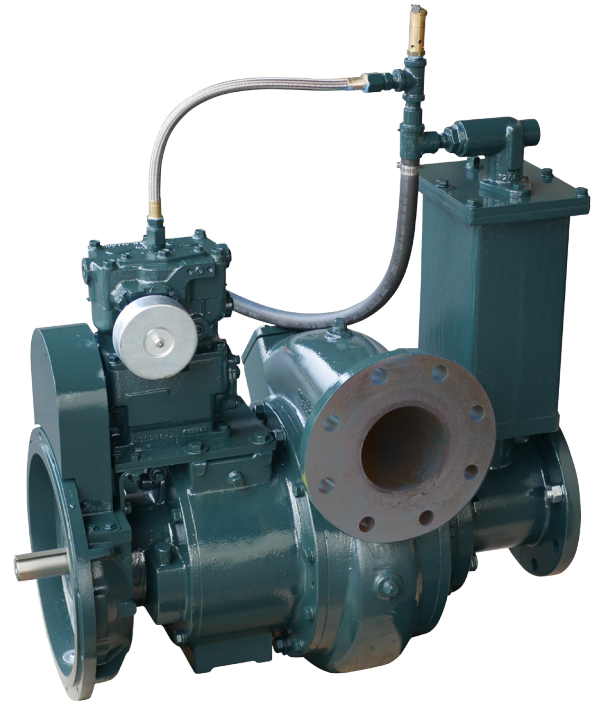
A typical picture of the pump is shown. Please contact Cornell Pump Company for further details. All information is approximate and for general guidance only.